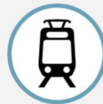
Link Light Rail