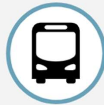
Bus Rapid Transit