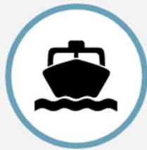
Water Taxi/Foot Ferry