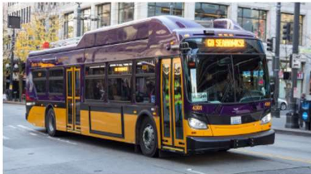
King County Metro

A Unique Partnership Between 7 Transit Agencies